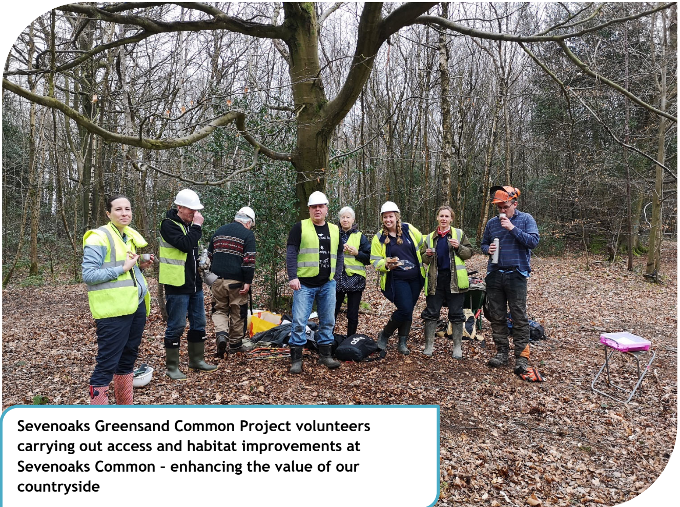
Sevenoaks Greensand Common Project volunteers carrying out access and habitat improvements at Sevenoaks Common - enhancing the value of our countryside

We want Sevenoaks District to be a place where people can enjoy clean and high quality urban and rural environments