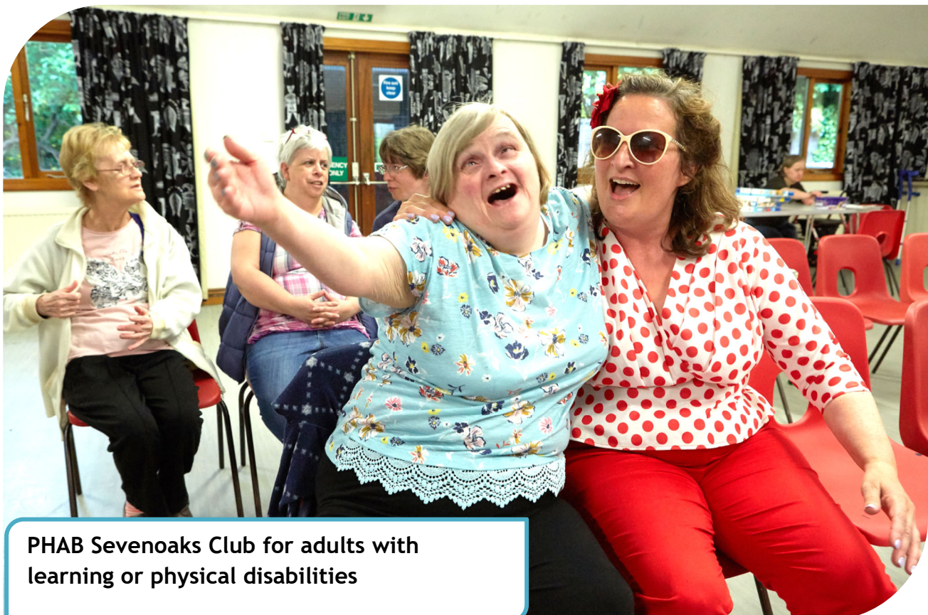
PHAB Sevenoaks Club for adults with learning or physical disabilities