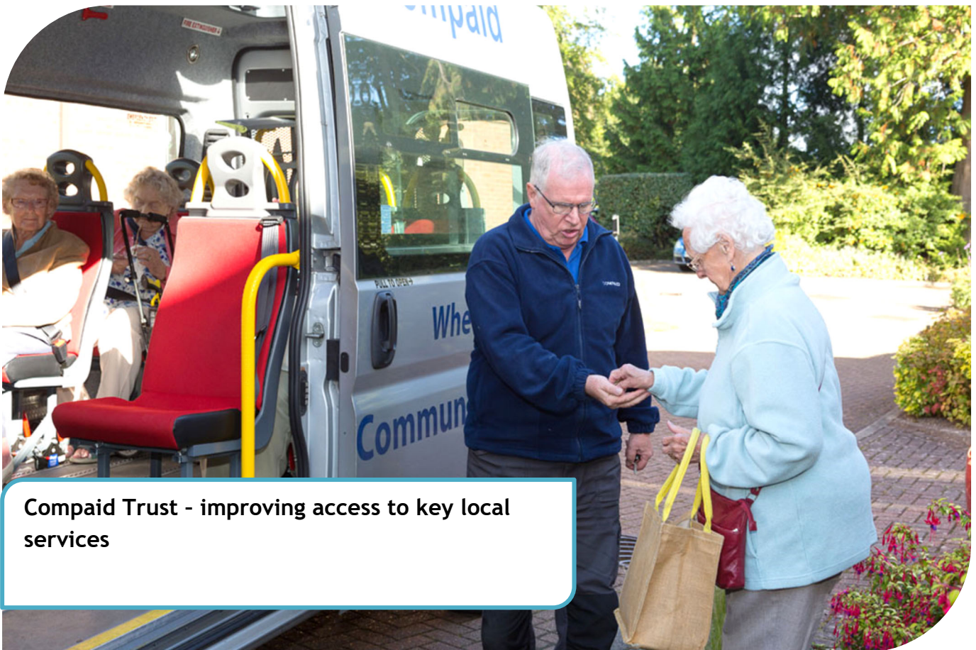
Compaid Trust - improving access to key local services

We want Sevenoaks District to be a place where people can live, work and travel more easily and are empowered to shape their communities