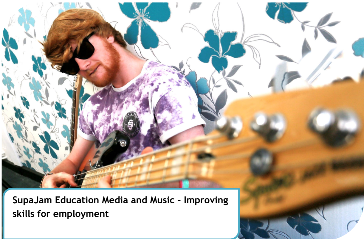
SupaJam Education Media and Music - Improving skills for employment