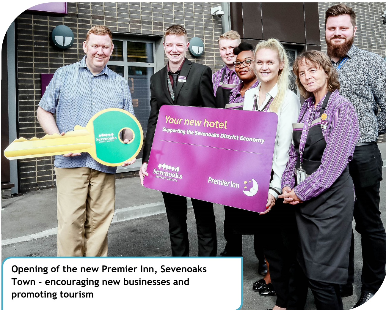
Opening of the new Premier Inn, Sevenoaks Town - encouraging new businesses and promoting tourism

We want Sevenoaks District to be a place with a thriving local economy, where businesses flourish, and people have skills for employment