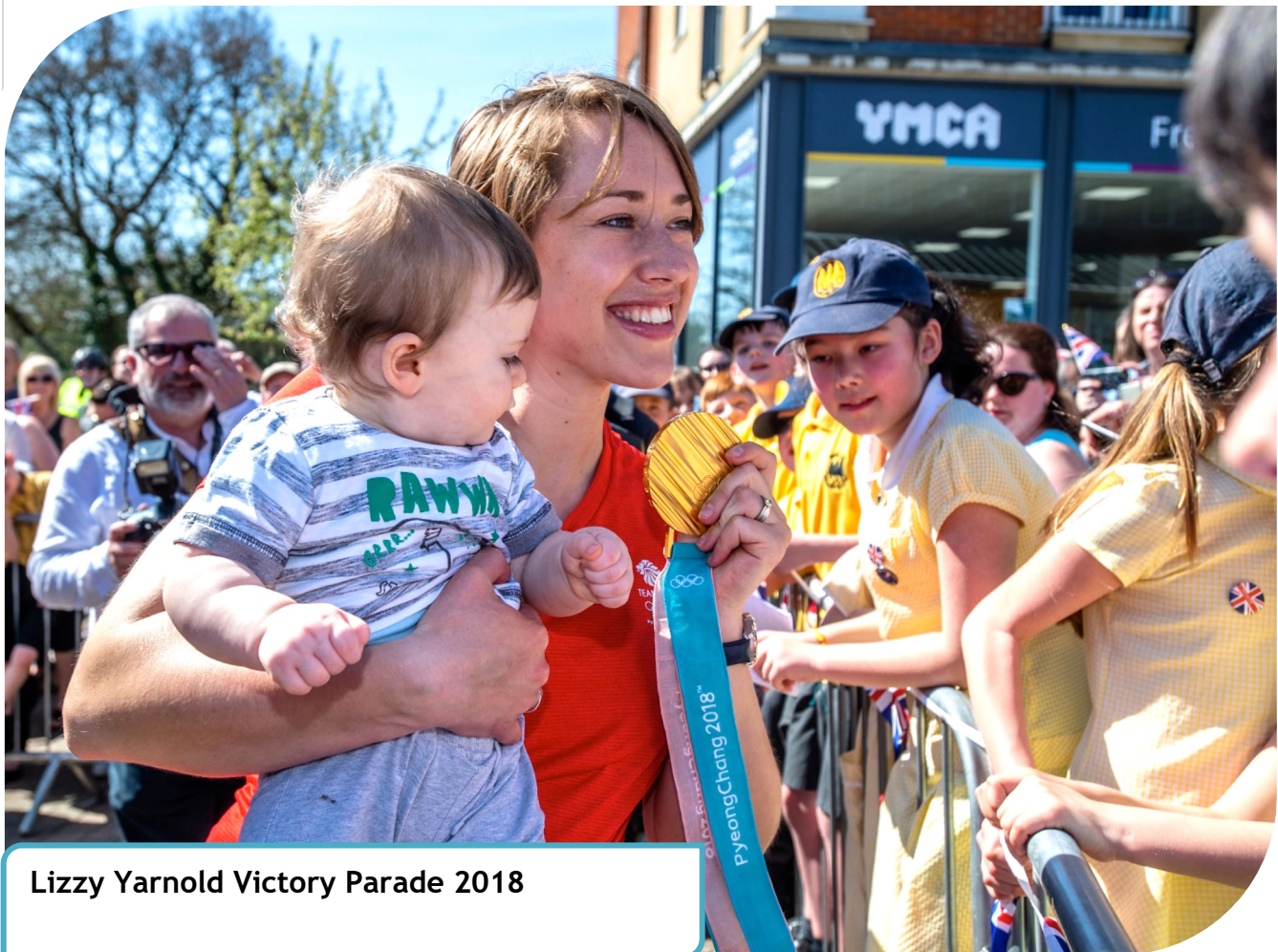
Lizzy Yarnold Victory Parade 2018