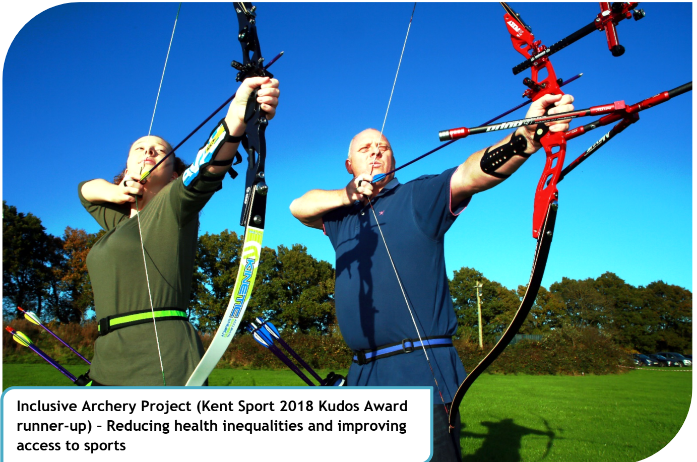
Inclusive Archery Project (Kent Sport 2018 Kudos Award runner-up) - Reducing health inequalities and improving access to sports

We want Sevenoaks District to be a place where people have healthy lifestyles and where health inequalities are reduced