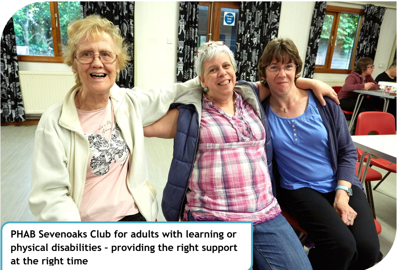
PHAB Sevenoaks Club for adults with learning or physical disabilities - providing the right support at the right time

We want Sevenoaks to be a place where people can be supported to lead independent, fulfilling lives and where children and young people have the best start