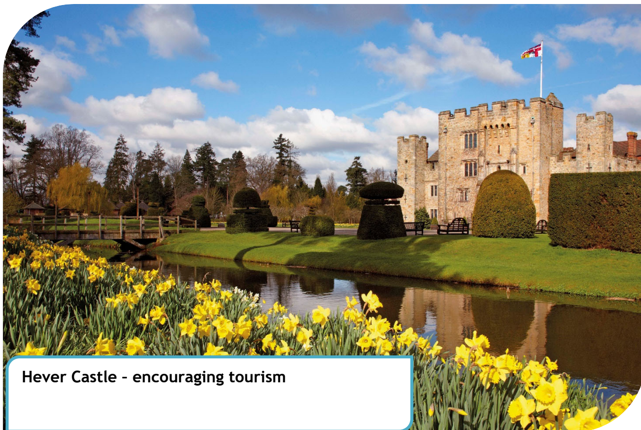
Hever Castle - encouraging tourism

For more information or to get in contact